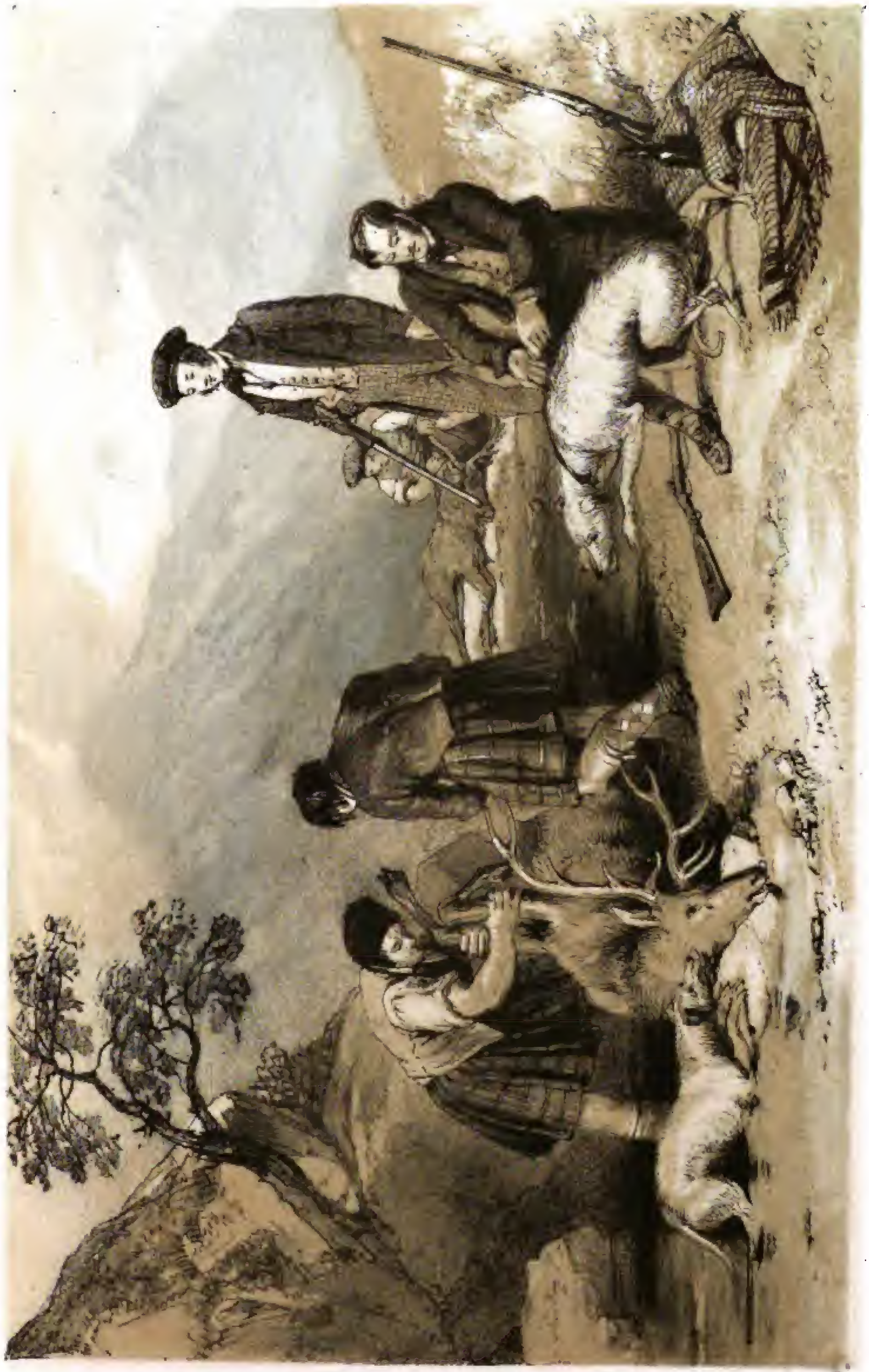
SKINNING THE DEAD DEER FROM A HUNTER